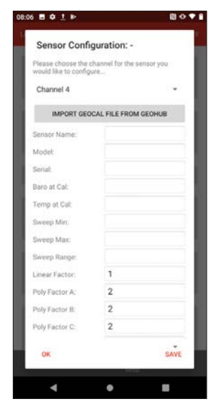
Fully configure each sensor with factors pulled straight from our cloud service GeoHUB.