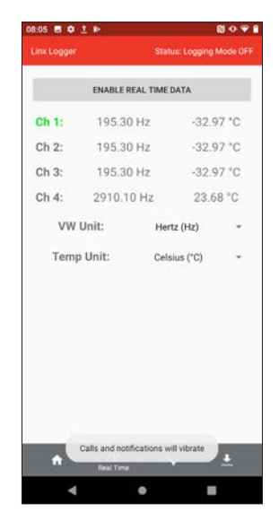
Easily see connected sensors readings in real time.