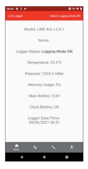
App automatically opens and loads logger configuration when connected.

This Android app allows you to setup your loggers and download data directly to your mobile device via a USB OTG cable, allowing you to send the data directly to those who need it. The app has inbuilt connection to our digital calibration data making downloading calibration factors even simpler.