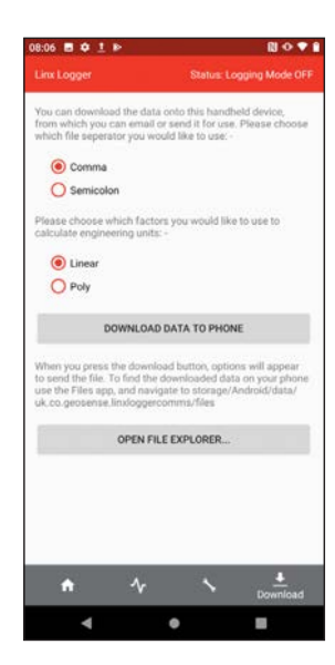
Download your data to the phone.