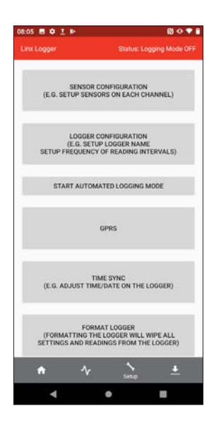
All configuration options from PC app built into the mobile app